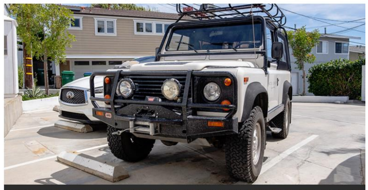
The Hotel Joaquin's 25-year-old Defender 90 is ready for any and all adventures.