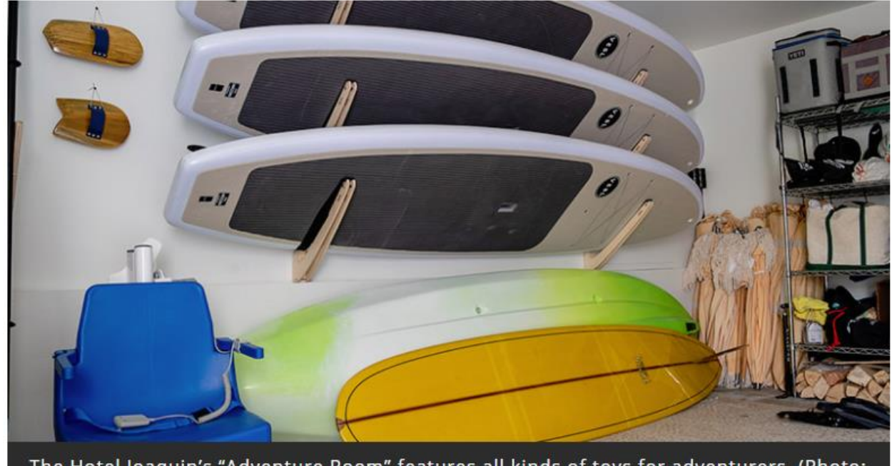
The Hotel Joaquin's "Adventure Room" features all kinds of toys for adventurers.

Once they choose their adventure, guests and a guide pile into the Defender and head off. Adventure guides are well-versed and able to point out choice coves and lookout points throughout the area.